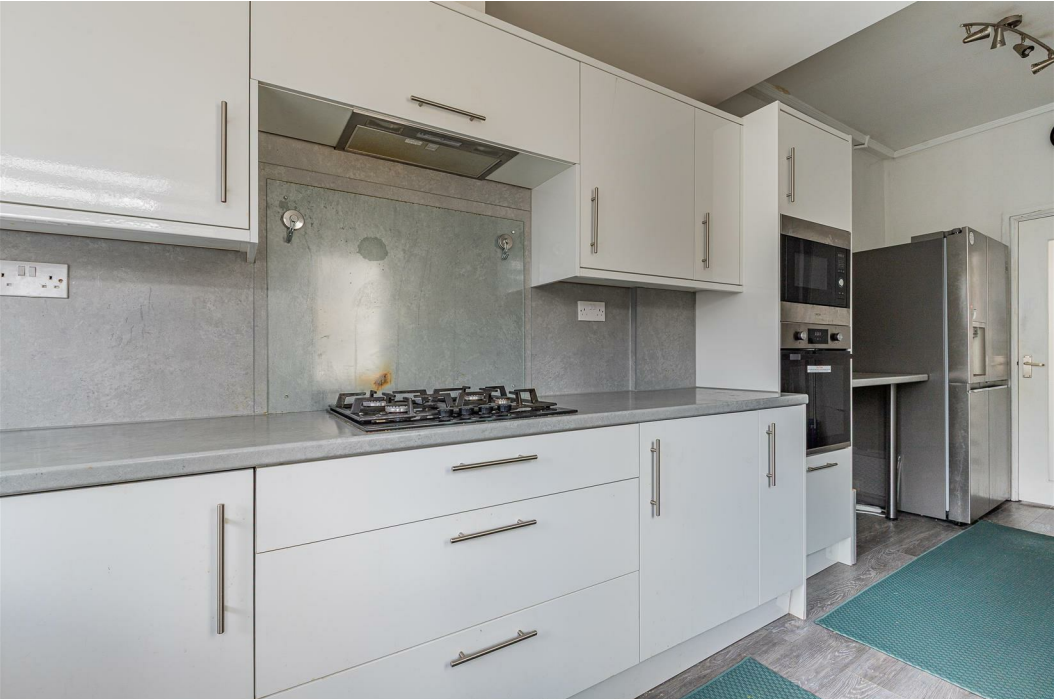
Lionel Road, Victoria Park